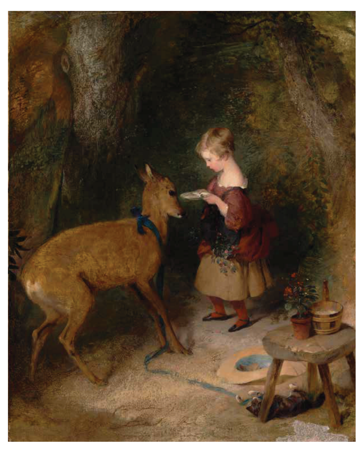
Sir Edwin Henry Landseer The Pets , n.d. Oil on canvas, 1925.169